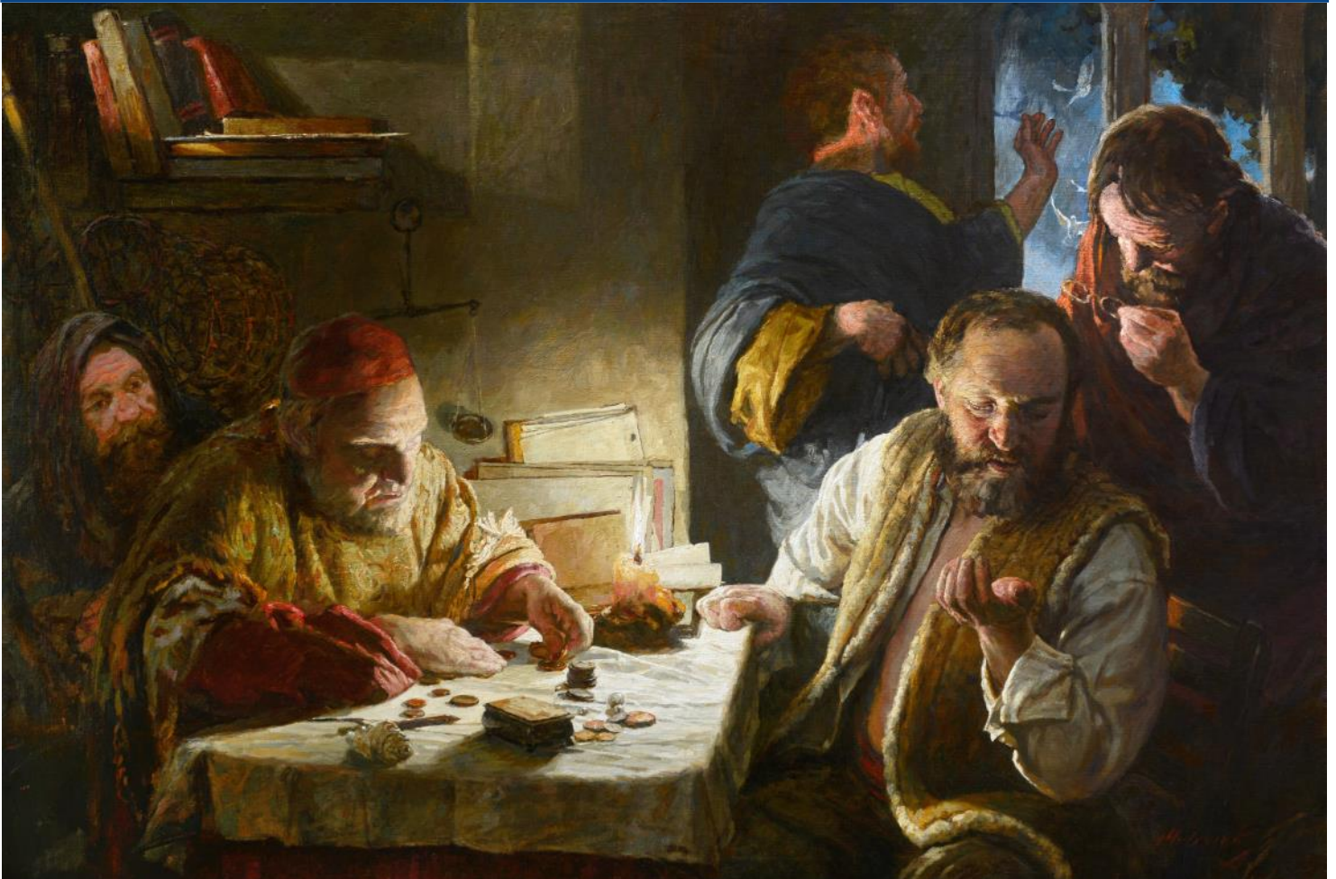
The Parable of the Pearl, oil on canvas, A.N. Mironov (photographer)