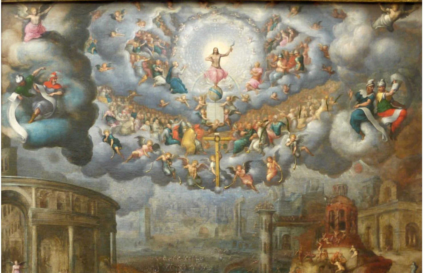
The Last Judgement, circa 1585, Jehan Cousin the Younger (1536-1595), oil on canvas, The Louvre Museum, Paris, France