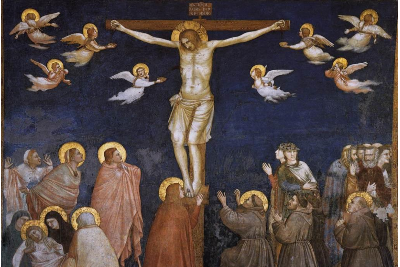
Crucifixion, 1310s, Giotto di Bondone (1267-1337), fresco, The Lower Basilica of San Francesco d'Assisi complex in Assisi, Perugia-Umbria, Italy